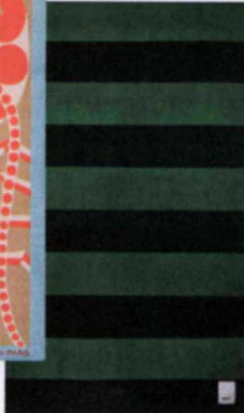
'Green Block Stripes' beach towel by Tekla, £115, Ssense ( ssense.com )