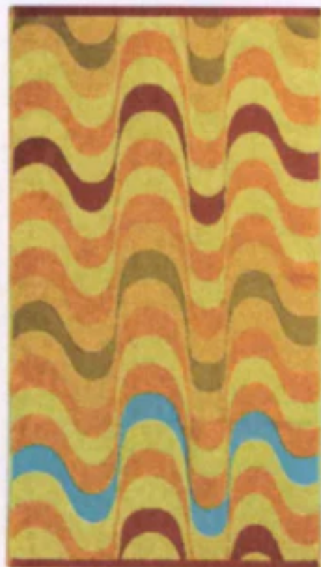
'Wave' bath sheet by Matthew Williamson, £39, John Lewis & Partners ( johnlewis.com )

Claim your sun lounger in style with the best towels for this year's hottest retreats