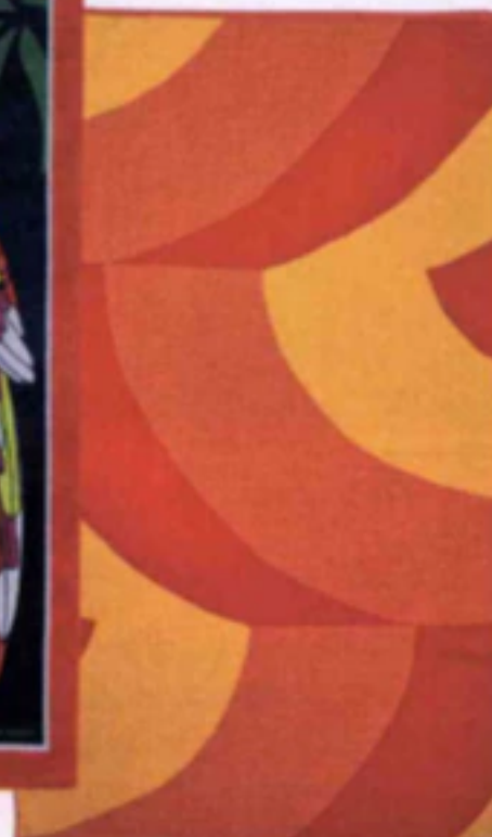
'Savanni' beach towel, £70, Marimekko ( marimekko.com ) LD