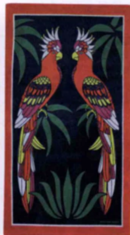
'Parrots' beach towel, £98, Jonathan Adler ( uk.jonathanadler.com )