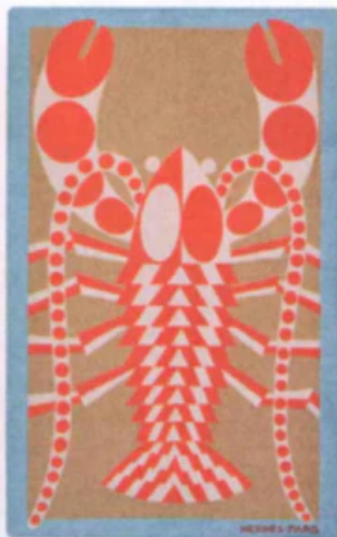
'Pince-Moi' beach towel, £560, Hermès ( hermes.com )